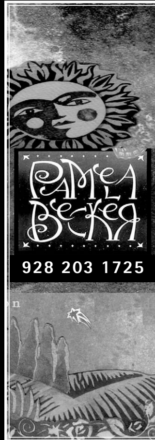
illustration graphic design