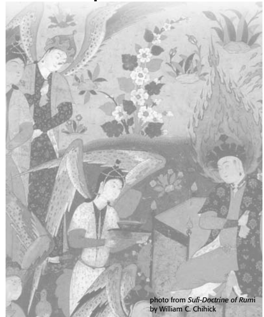
photo from Sufi-Doctrine of Rumi by William C. Chihick

When I see your face, the stones start spinning. Your robe brushes a thornbush and a deep chord of music sounds. A red glint occurs in a granite outcrop and the whole cliff turns to ruby! This crazy, ecstatic dancing is the One reality - storm after storm of passion on a bed of peace.